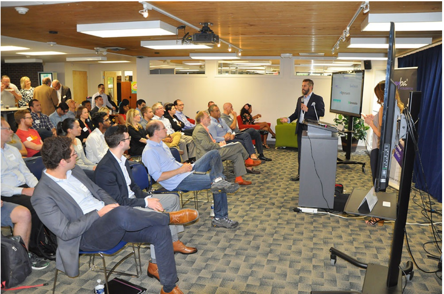
Pitch Club MI came to Ann Arbor in June 2018, pictured here.